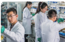
Professional R&D Department