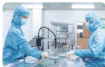
Strict Quality Management